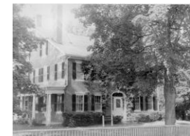
Homer House, West Townsend