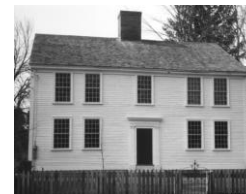
The Reed House