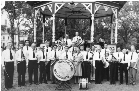
Townsend Band at the Town Bandstand