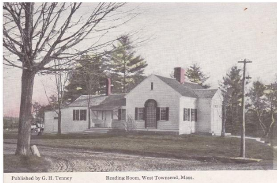
Reading Room, West Townsend