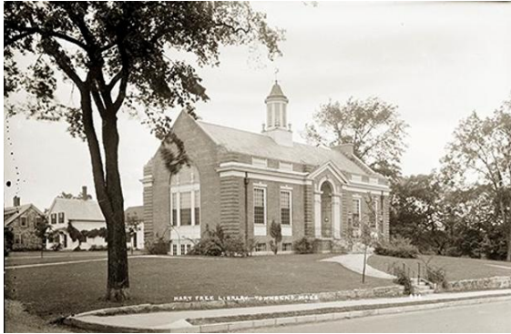
The Hart Library